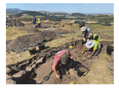
Volunteers excavating Tinnis Fort in 2022

Focussing on Tinnis Castle and hillfort, the team of volunteers, including several members of our Society and Biggar Archaeology Group, explored archaeological sites connected with the Merlin legend that has been associated with the village of Drumelzier since the medieval