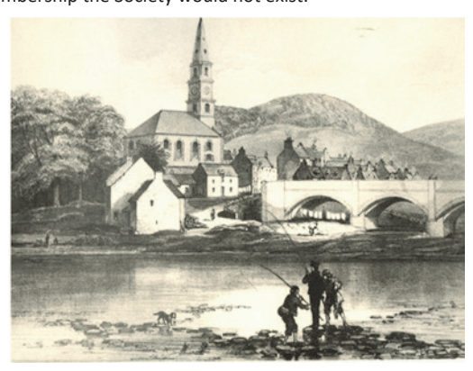
Peebles and the meal mill, (from about 1799)

The members of the Committee wish everyone a very happy summer and we look forward to seeing you all at the talks in August and September and over the winter. Your support is crucial to us; without our loyal and supportive membership the Society would not exist.